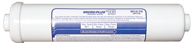
#4614-Y8 – (Length 14.125", Diameter 2.59")