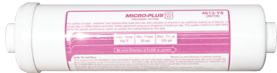
#4613-Y8 – (Length 11.375", Diameter 2.59")